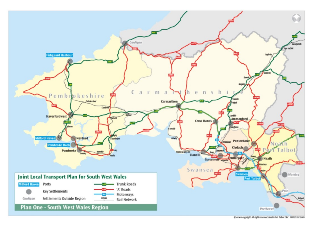
Figure 1 – Area Considered in the South West Wales Regional Transport Plan.